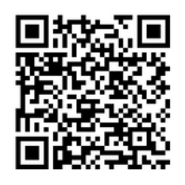
Lactation Rooms by Campus

As a reminder, at <u>Parnassus Heights</u>, the 4th floor Clinical Science Building (CSB) has two lactation rooms that now have badge readers. Additionally, there is a new lactation room L170L within the ED staff lounge for ED only, and one new lactation room on B1, room L008H.