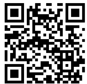
Visit their website here!