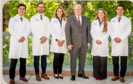
UCSF Otolaryngology, Head & Neck Surgery