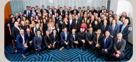
UCSF Orthopedic Surgery

OHNS celebrated with a Sooy Year-End Graduation weekend including the resident research symposium and a graduation dinner!