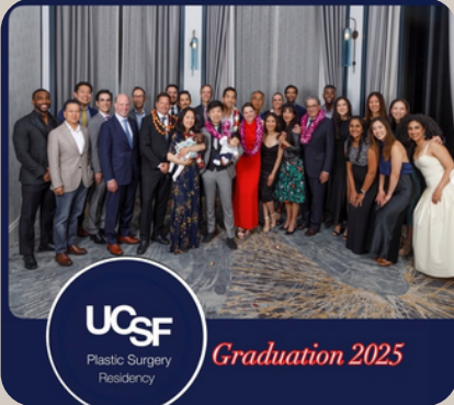
UCSF Plastic Surgery