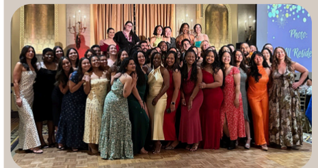
UCSF Obstetrics and Gynecology