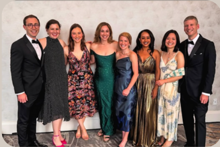
UCSF General Surgery

Orthopedic Surgery held their annual Bones Ball, honoring the graduating residents and fellows, recognized faculty achievements, and reflected on a year of mentorship, growth, and excellence.