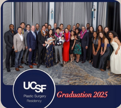
UCSF Plastic Surgery