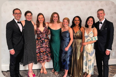
UCSF General Surgery

Orthopedic Surgery held their annual Bones Ball, honoring the graduating residents and fellows, recognized faculty achievements, and reflected on a year of mentorship, growth, and excellence.