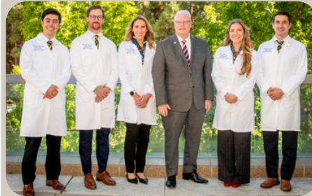
UCSF Otolaryngology, Head & Neck Surgery