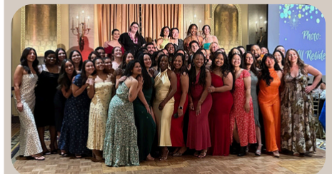
UCSF Obstetrics and Gynecology