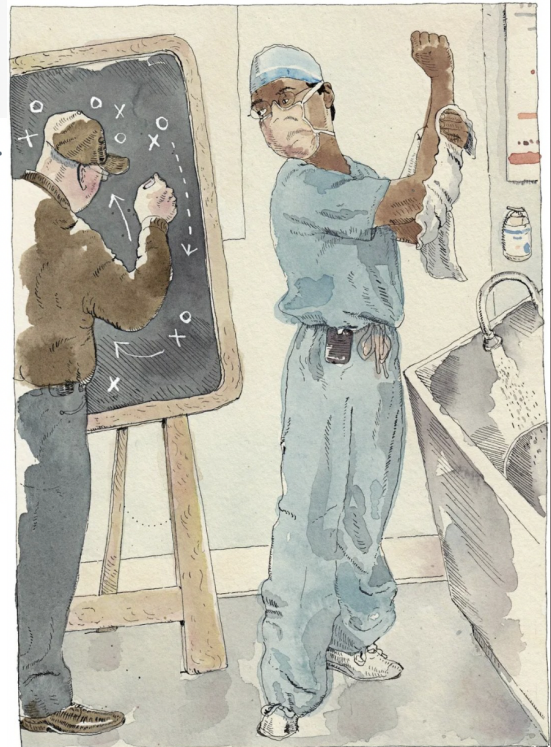
No matter how well trained people are, few can sustain their best performance on their own. That's where coaching comes in. Illustration by Barry Blitt

This old article is a classic and I still make my trainees read it.